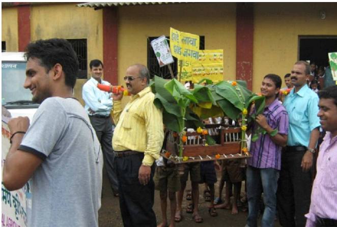
Mega tree plantation