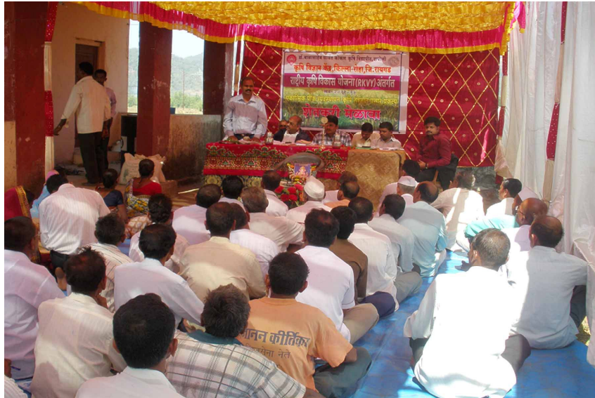
Farmers Rally on Transfer of Technology in Rice under RKVY (15 ha)