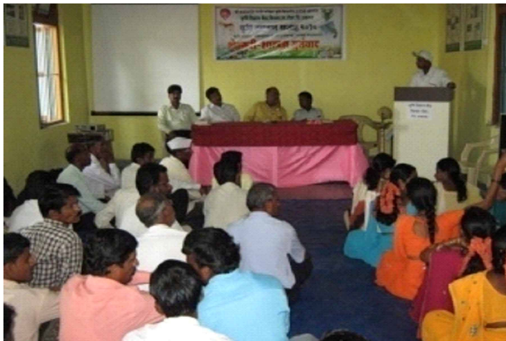
Ex trainee Sammelan